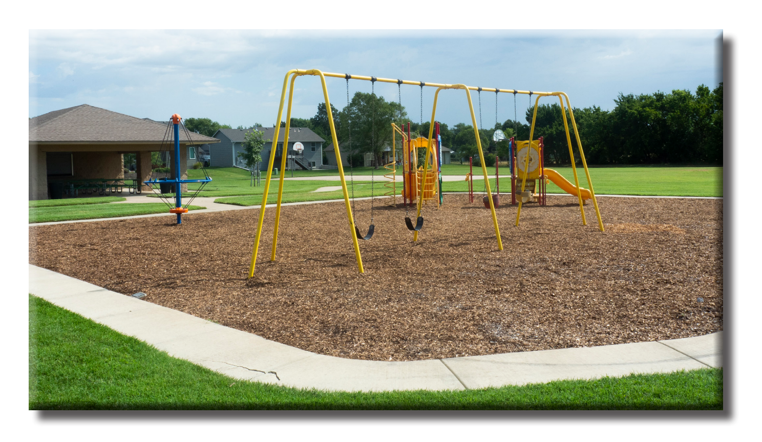
Kirby Park and Shelter