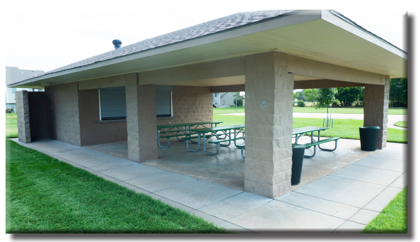
Kirby Park Shelter