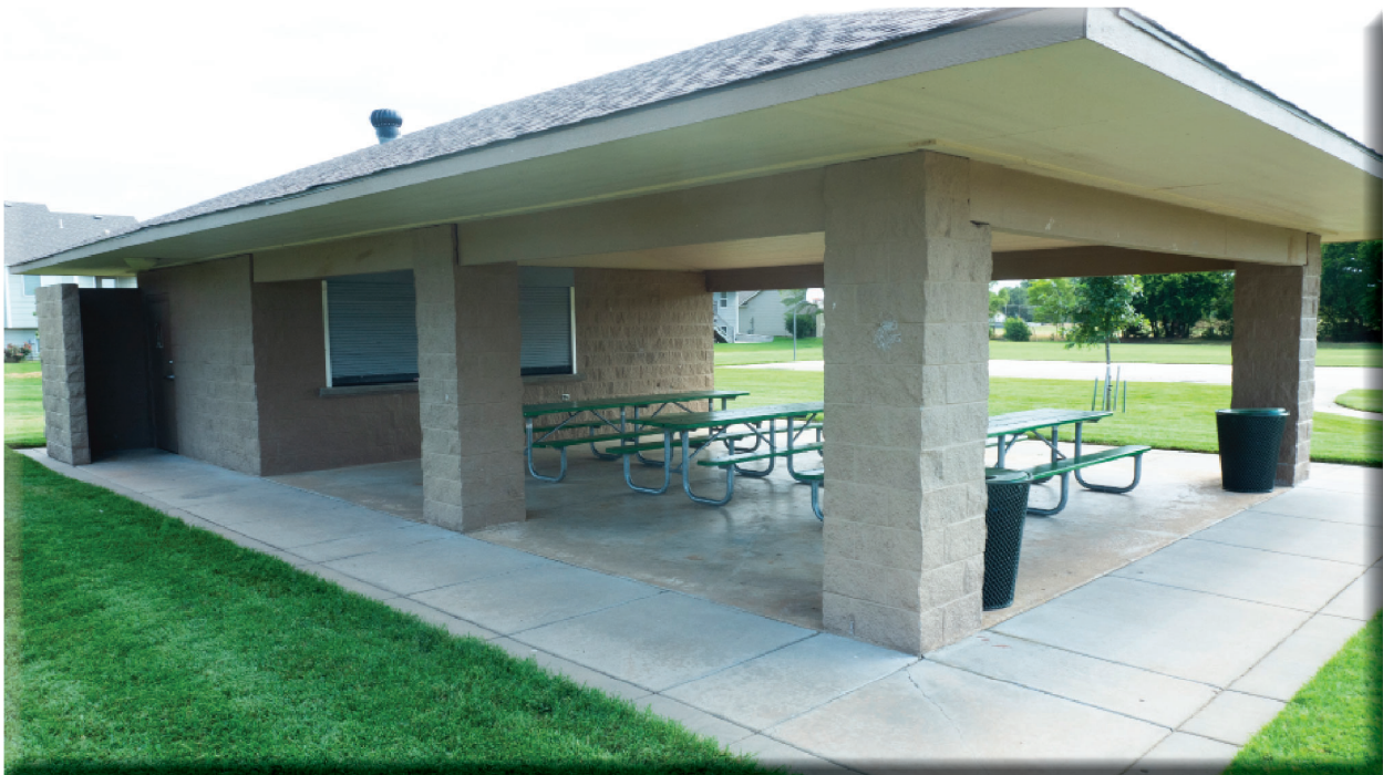
Kirby Park Shelter