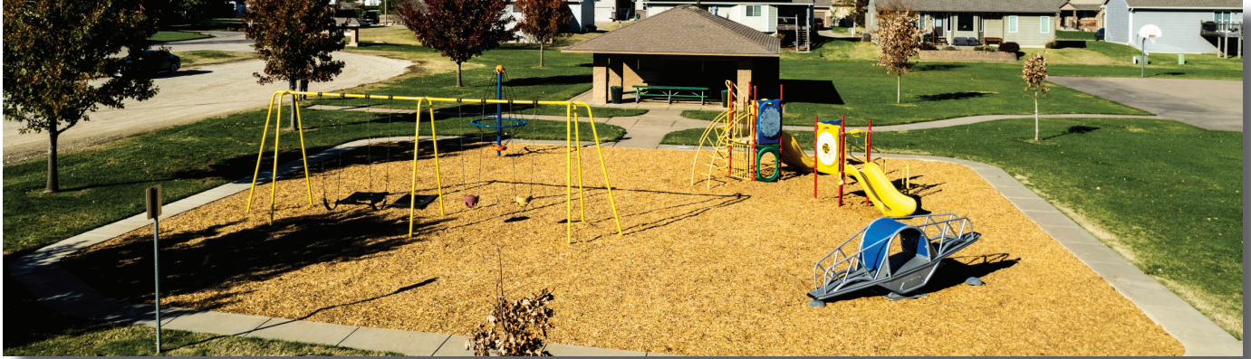
Kirby Park and Shelter